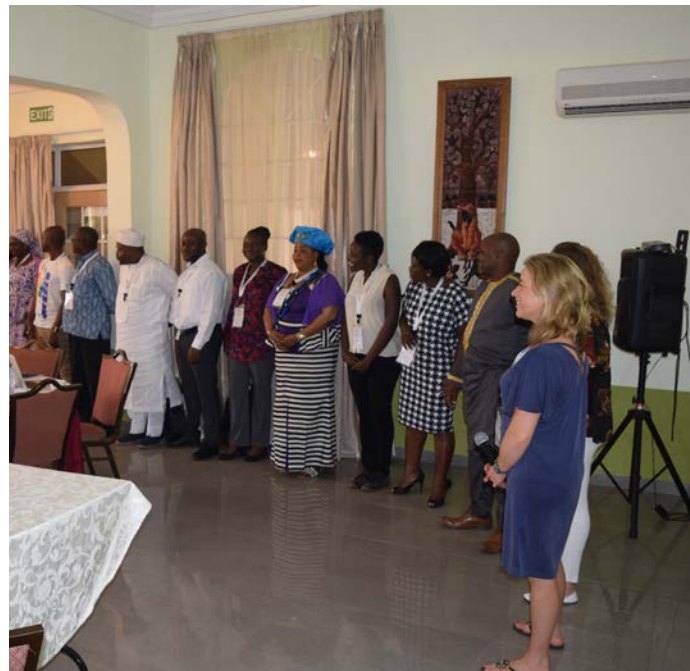
Thanks to our members for their inputs!

This year, SWG will focus on a living income analysis, and an industry life cycle assessment, as well as building new public private partnerships to scale up women’s empowerment and environmental activities in member supply chains.