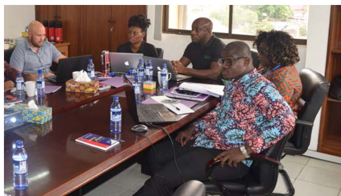
Thanks to our members for their inputs!

They also agreed to produce a quality standard for unrefined shea butter.