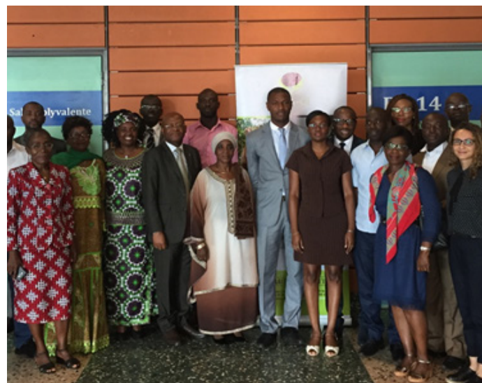
Family after the SSI Workshop in Ivory Coast

The next SSI workshop is in Togo on February 14.